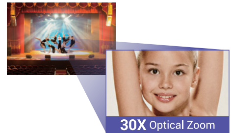
30X Optical Zoom

Experience the exceptional power of the TR335 camera's astounding 30X optical zoom. This feature seamlessly operates even while the camera is panning and tilting, granting you the ability to accentuate content and quickly shift between shooting perspectives. Embrace the advantage of dynamic, crystal-clear video feeds through the TR335's unparalleled PTZ performance.