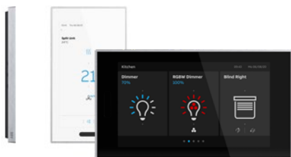
ABB SmartTouch® 10"