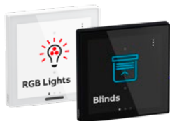
ABB RoomTouch® 5"